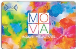
Back Imprint Double-sided Decoration