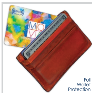
Full Wallet Protection